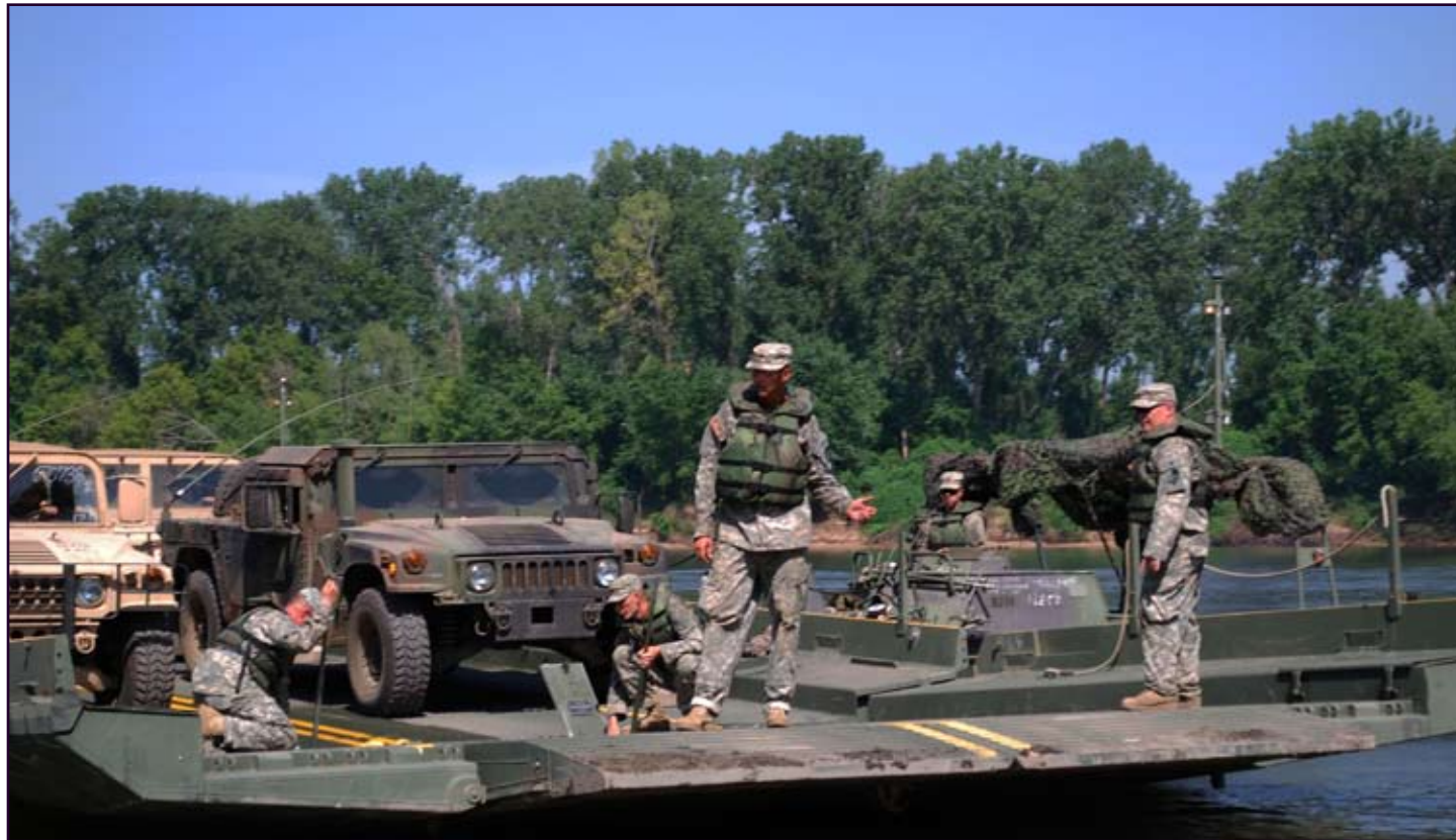
Soldiers from the 459th Engineer Company transport vehicles across a river at Fort Chaffee Ark., with a raft they constructed utilizing Improved Ribbon Bridge Sections.