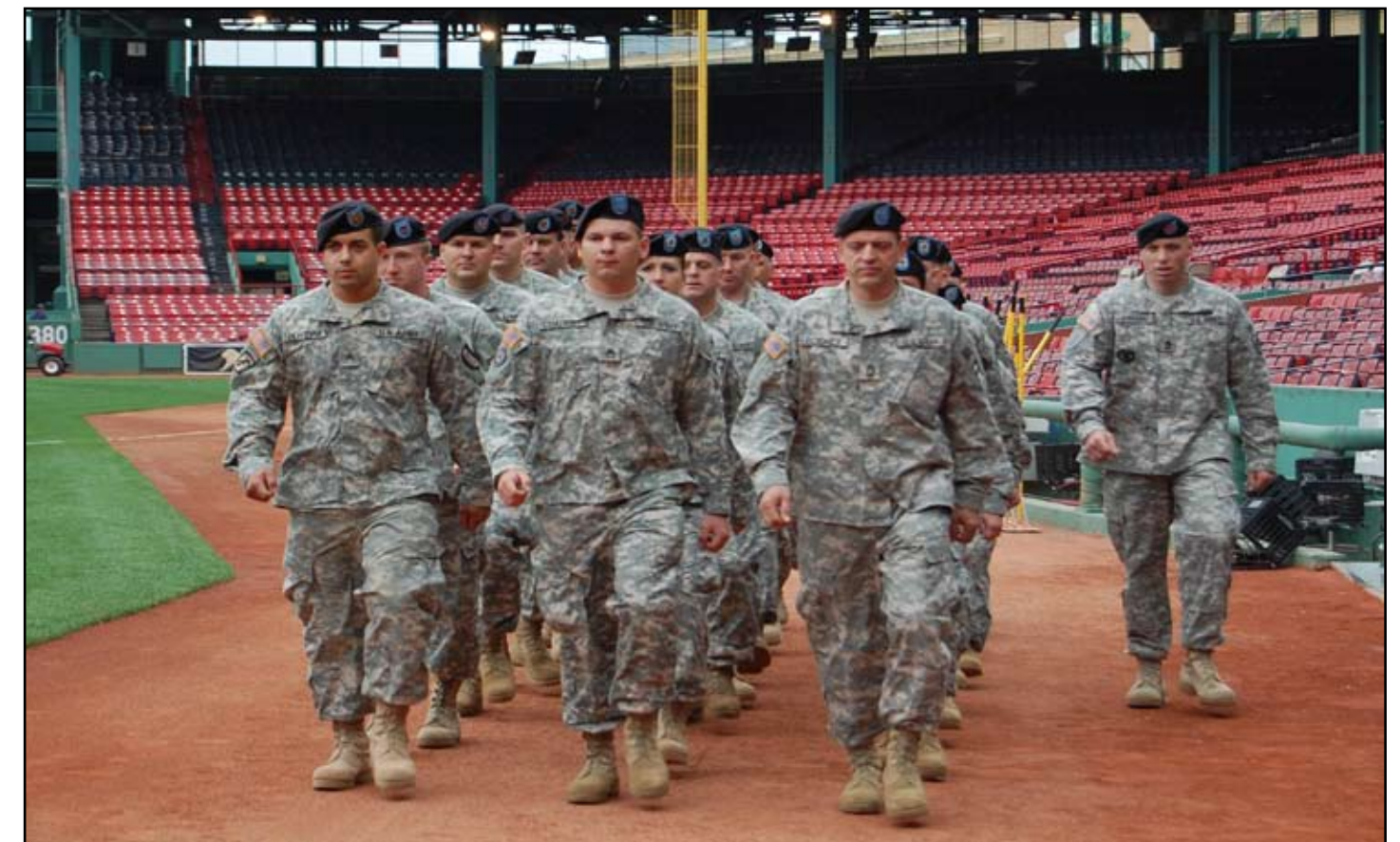
New England Army Reserve Soldiers, march in formation at Boston's Fenway Park in preparation of a group reenlistment ceremony. The ceremony was held on Sept. 11 to memorialize the victims and to show the Soldiers' commitment to continue serving their country.