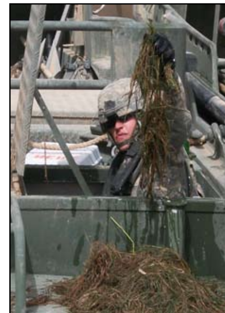
A Soldier from the 401st Multi-Role Bridge Company cleans debris from of his boat's hydro jets during a bridging project across the Tigris River in Iraq.

“It's a proud feeling when the bridge is complete and you see all the cars waiting to use our 401st bridge,”