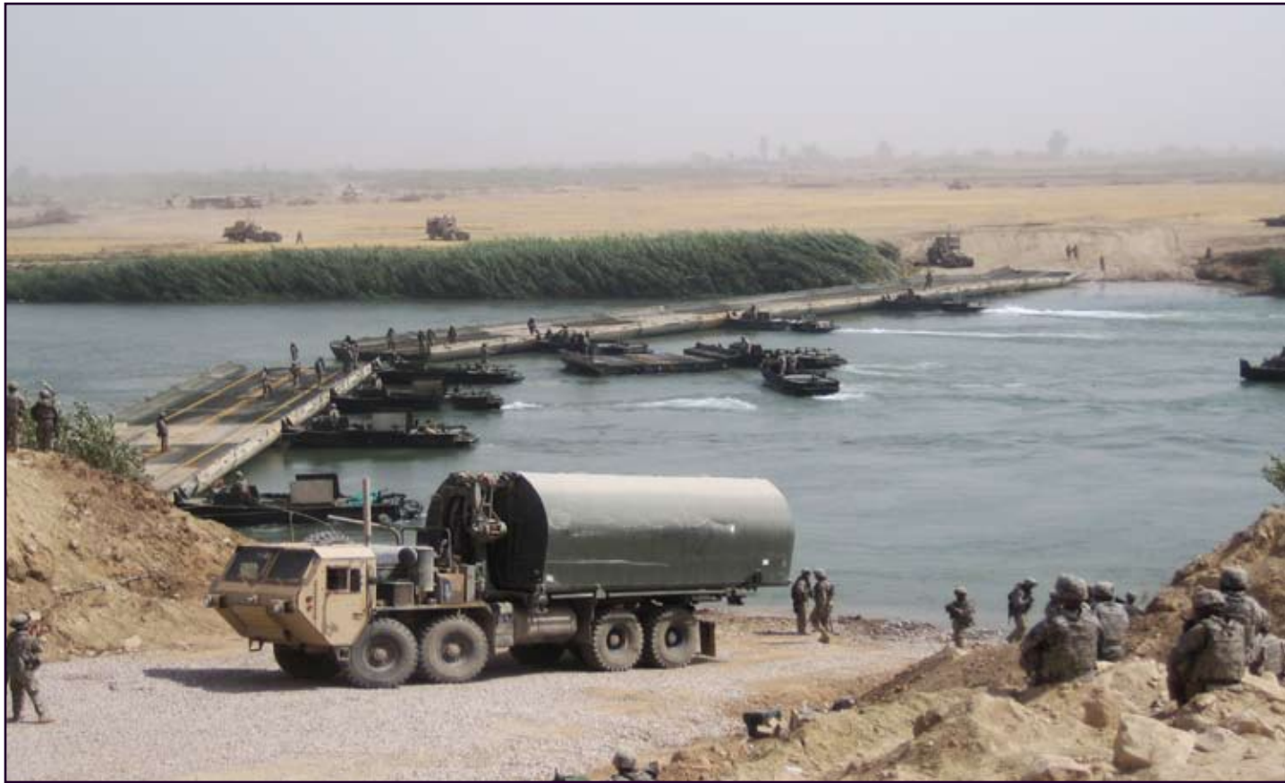
Soldiers of the 401st Multi-Role Bridge Company construct a bridge across the Tigris River near Hammam Al Alil, Iraq. The bridge saves coalition patrols 4 hours of travel time.