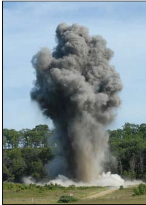
The explosion that rocked the fort. This giant smoke cloud was created when the engineers of the 424th and HHC detonated several pounds of explosives at one of Fort McCoy's demolition ranges. Over the course of the day the engineers detonated five explosives at the range.

The different training consisted of demolition, construction of roads and a retention pond, building a mock village along a convoy route, and to wrap it all up there was a three day field training exercise for all the Soldiers to test their deployment