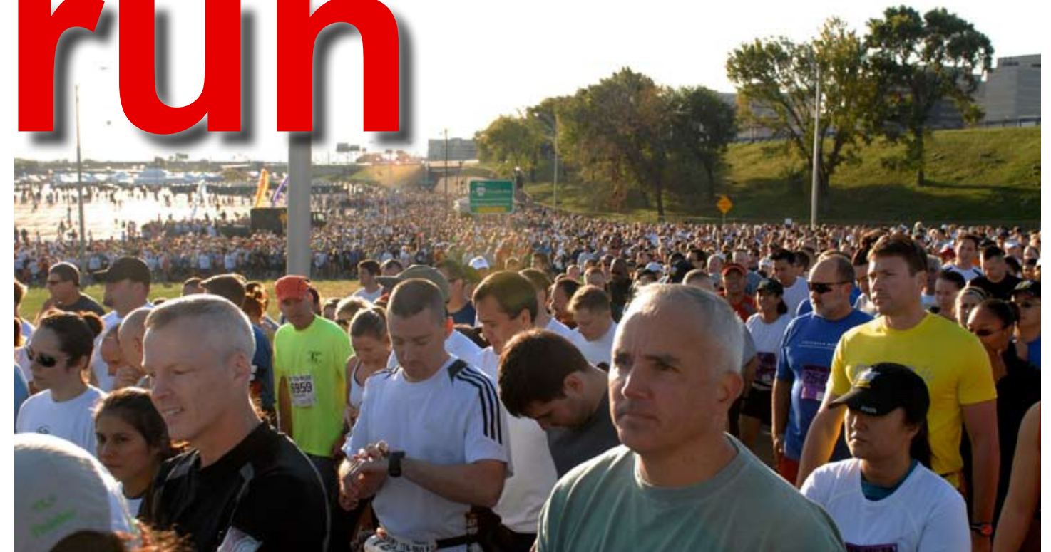
Thirty thousand runners prepare to run the 26th Annual Army Ten-Miler race in Washington, D.C., Oct., 6, 2009.