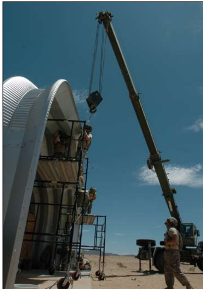
Engineers from the 492nd Combat Engineer Company, Mankato, Minn. use a crane to lift metal sheeting into place as they construct Quonset Huts at Forward Operating Base Miami on July 14th during Operation Sand Castle 2009.

Early into the mission, the convoy encountered a simulated enemy ambush that included a road side bomb. The Soldiers neutralized the enemy with no casualties, and then cleared the area of additional threats before continuing on.